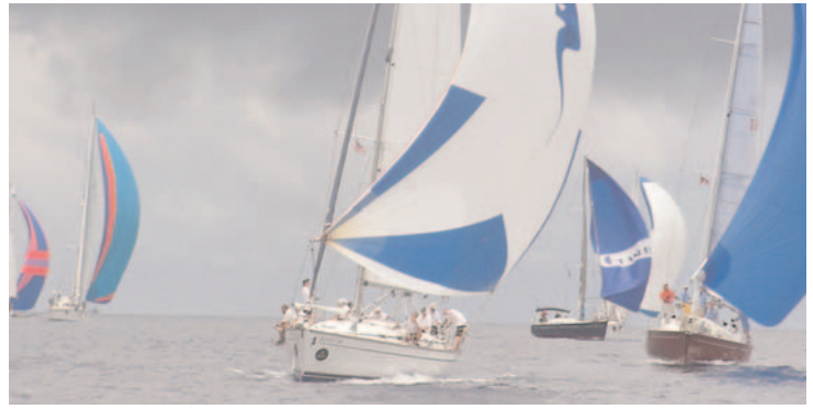
Spinnaker-less Wonderland about to be rolled by fast closing fleet

Since Evi is bound for the Panama Canal and the South Seas, we were considering doing Antigua again next year on a charter boat. Cost is about dou-