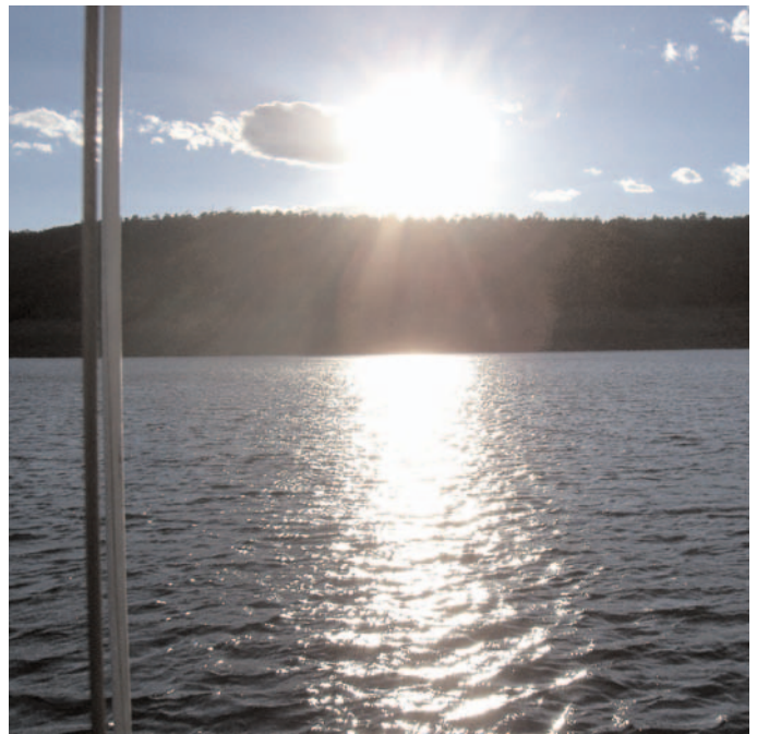
Enjoying the sunset on Carter Lake, from a sailboat