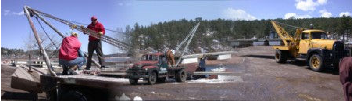
Gotta Love those darlin' Boom Trucks! They are so ugly they're cute! We could not do it without 'em!