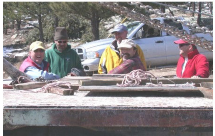
Here, members of the BREAK committee discuss who knows what?

My hope was to have these items done before dock put in so as to be able to enjoy the sailing season, so that mission is done. The water is up, the docks are in and it looks like it should be a great year of sailing.