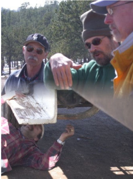
Members of the BRAKE committee (above) discuss the demise of the white boom truck's brakes.