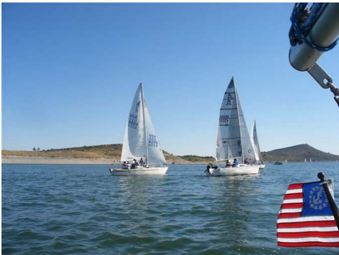
View of the McGann Cup from Miles Away