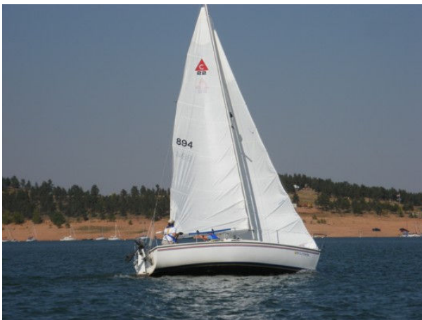
Toto enjoys one last time!