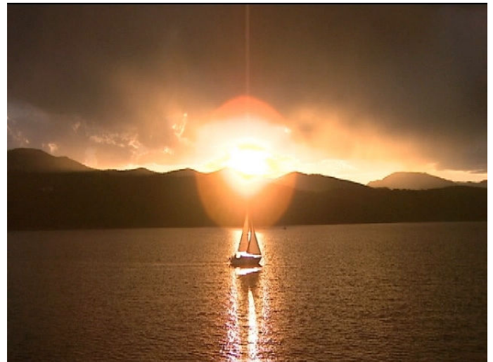
Photo of "Wildcat" at sunset by Eric Blumer for NewsChannel 4. Used with permission.

We look forward to seeing everyone October 17th!