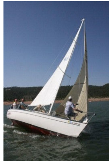
"Are you sure that forestay is attached, now?"

We enjoyed the socializing (and tasty food) at the fall banquet last month. And, how very well slip pull out went this year.