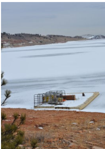
Courtesy Dock frozen in February 27

Much of the needed maintenance was performed as we pulled the slips out, but there may be a need for some more work. Jeff and I will update the website and send out an email to the club if there will be a workday prior to March 27th.