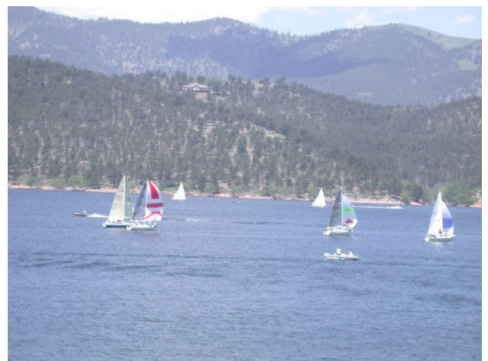
We'll be sailing sooner than you think!

http://www.nytimes.com/2004/04/02/travel/havens-sock-burning-and-sailing-the-rites-of-spring.html?pagewanted=all