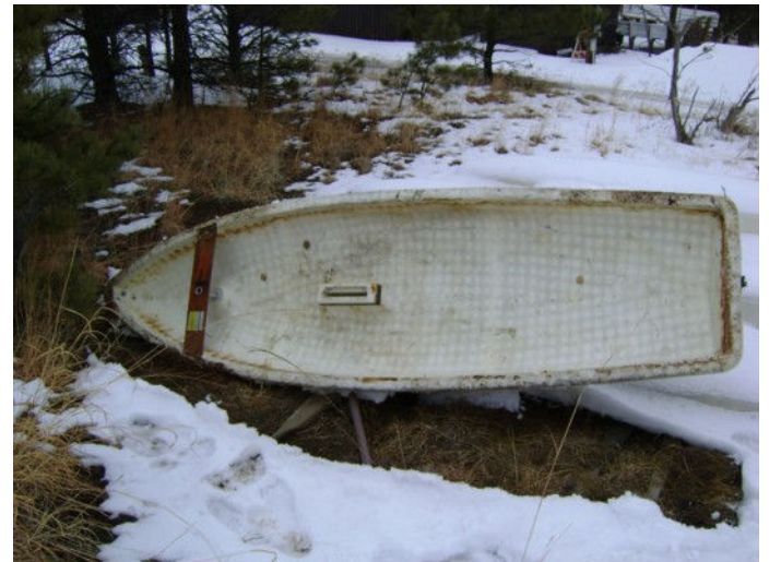
Sea Snark

This month's featured club boat is a Sea Snark.