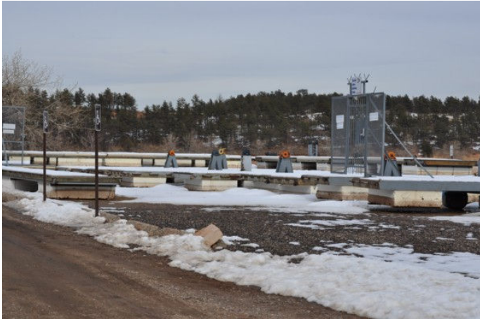
Frozen Slips on February 27

your assistance allows us to launch the slips in a single day. If you are not currently a slip-holder, dock put-in and pullout workdays are an easy way to meet your required hours.